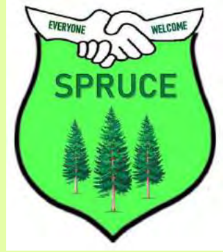
Spruce House Shield by Lois 8D