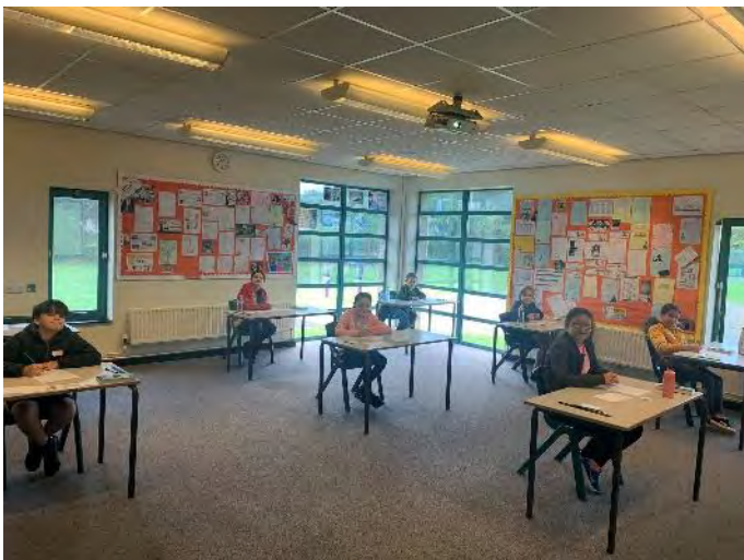
Big Step Transition 2020 at Broadoak Academy

In the meantime, if you have any questions or anything you wish to share with us, please do not hesitate to get in touch using parents@broadoakacademy.clf.uk