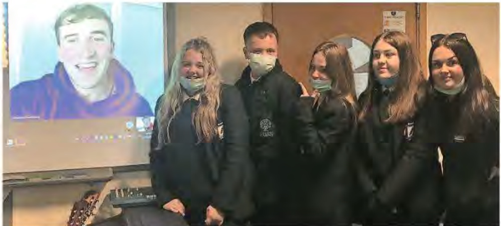
Students talked to Callum Scott Howells over Zoom.

While Callum excited the students by mentioning the celebrities he has worked with, he also gave students an insight