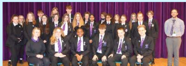
Year 11 Prefects 2021-22