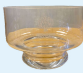
Community Rose Bowl