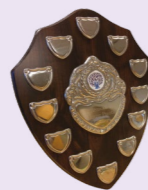
House Point Shield