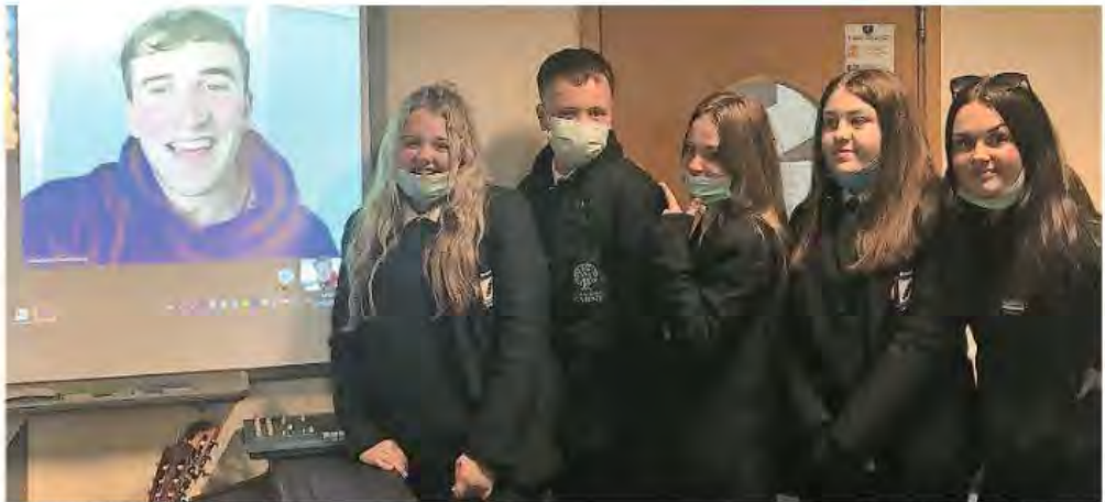
Students talked to Callum Scott Howells over Zoom.

While Callum excited the students by mentioning the celebrities he has worked with, he also gave students an insight