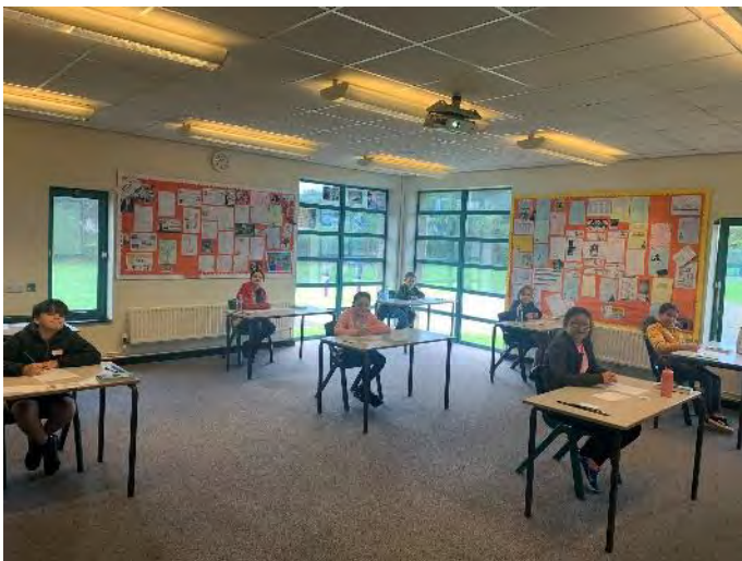
Big Step Transition 2020 at Broadoak Academy

In the meantime, if you have any questions or anything you wish to share with us, please do not hesitate to get in touch using parents@broadoakacademy.clf.uk